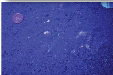
... the same sample area under the LVUV light.