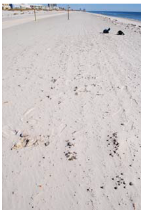
Gulf Coast beach during daylight...