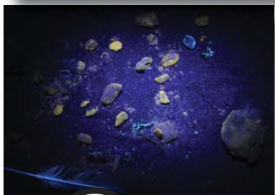
Tar balls and beach debris under the LVUV light. Note the bright orange of the tar balls.